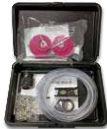
TSI Fit Test Adapter Kit