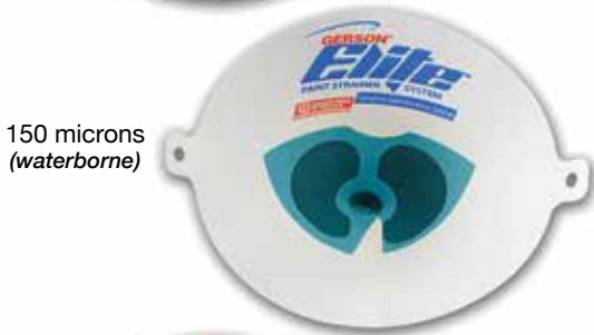
150 microns (waterborne)