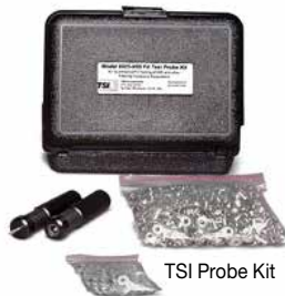
TSI Probe Kit