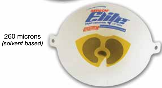
260 microns (solvent based)