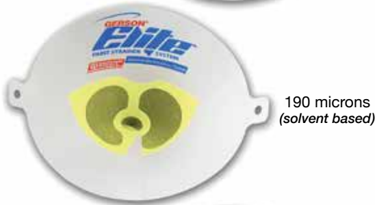
190 microns (solvent based)