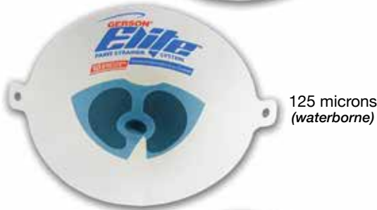
125 microns (waterborne)